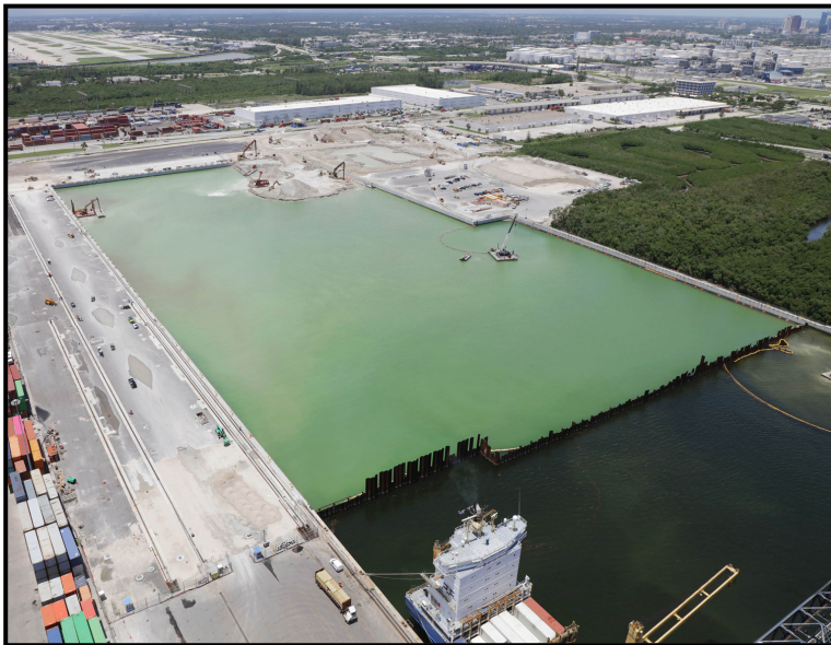
Turning Notch Under Construction